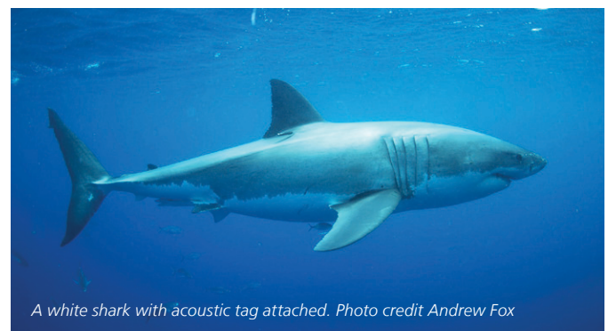
A white shark with acoustic tag attached.

Strategies 1 and 4: The NIGMP management plan is being implemented through the marine parks program and a permitting system is in place to manage shark cage diving and research activities.