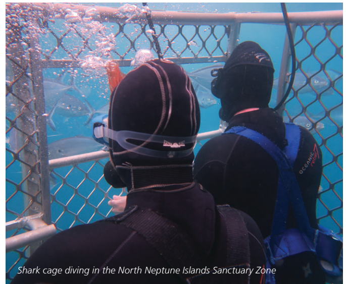
Shark cage diving in the North Neptune Islands Sanctuary Zone